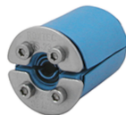
RS OMD seals

For detailed information, please visit roxtec.com .